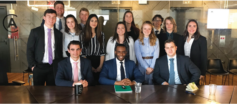
Soni Resources Group in NYC

The Woltemade Center and Economics & Business Department are pleased to offer several outstanding scholarships and grants: