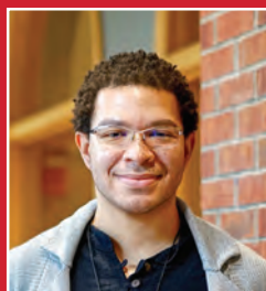
Aron Patton Welch Hall, House of Black Culture, and Honors House

RESIDENTIAL LIFE manages nearly 1,500 beds ACROSS 750 rooms IN 22 buildings