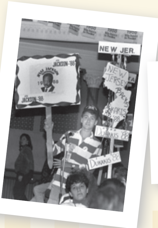
1988 - Student delegates are fired up for Rev. Jesse Jackson and Massachusetts Gov. Michael Dukakis.

Only once did OWU students correctly predict both the presidential and vice presidential candidates. This happened in 1984, when OWU nominated former Vice President Walter Mondale and Congresswoman Geraldine Ferraro.