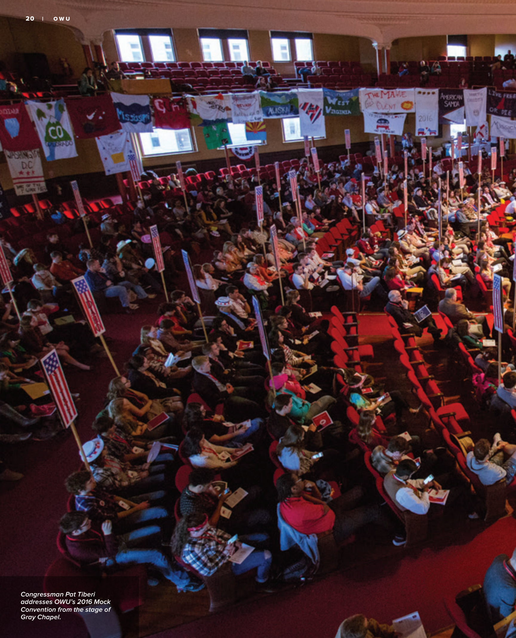
Congressman Pat Tiberi addresses OWU's 2016 Mock Convention from the stage of Gray Chapel.