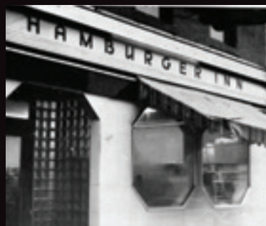
Vintage photos courtesy of The Hamburger Inn

December 2013, in which the floors in the dining area and bathrooms were replaced and a new patio and two new bathrooms were built. Kitchen equipment was added and updated, the front windows were replaced, and new heating and cooling was installed. The front door and facade of the building were both restored to original condition. Despite all the spit and polish, however, these restorations don't take away from the diner's atmosphere, a proud tradition that has lasted 84 years.