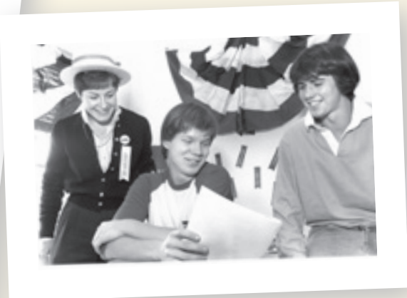
1984 - U.S. Sen. Gary Hart (D-CO) won the nomination in the mock Democratic convention.