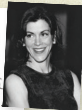
Actress Wendie Malick '72