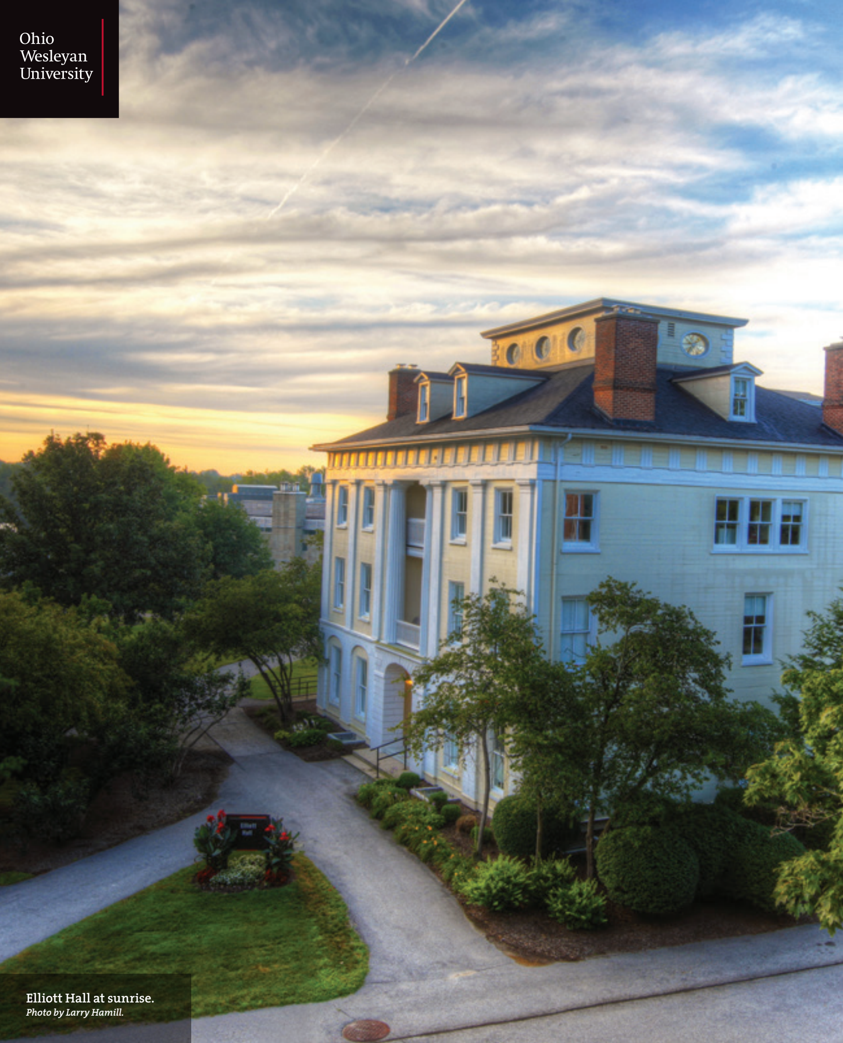
Elliott Hall at sunrise.