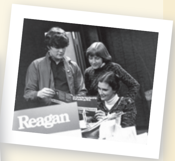
1980 - Student delegates chose George H. W. Bush for president and Howard Baker for vice-president at the mock Republican convention.