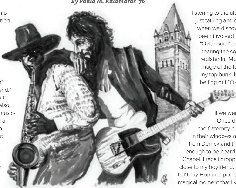
Illustration by Catie Beach '16

On a less cringe-worthy note, whenever I hear Pink Floyd's "Money" track from "The Dark Side of the Moon", I vividly recall how during my first year, my roommate and I were hanging out in our room in Stuyvesant with our boyfriends