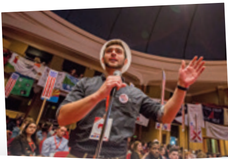
Left, the delegates put their rhetorical skills to work.

Louthan believes students made the most impressive selection in the 1984 convention, when they nominated a