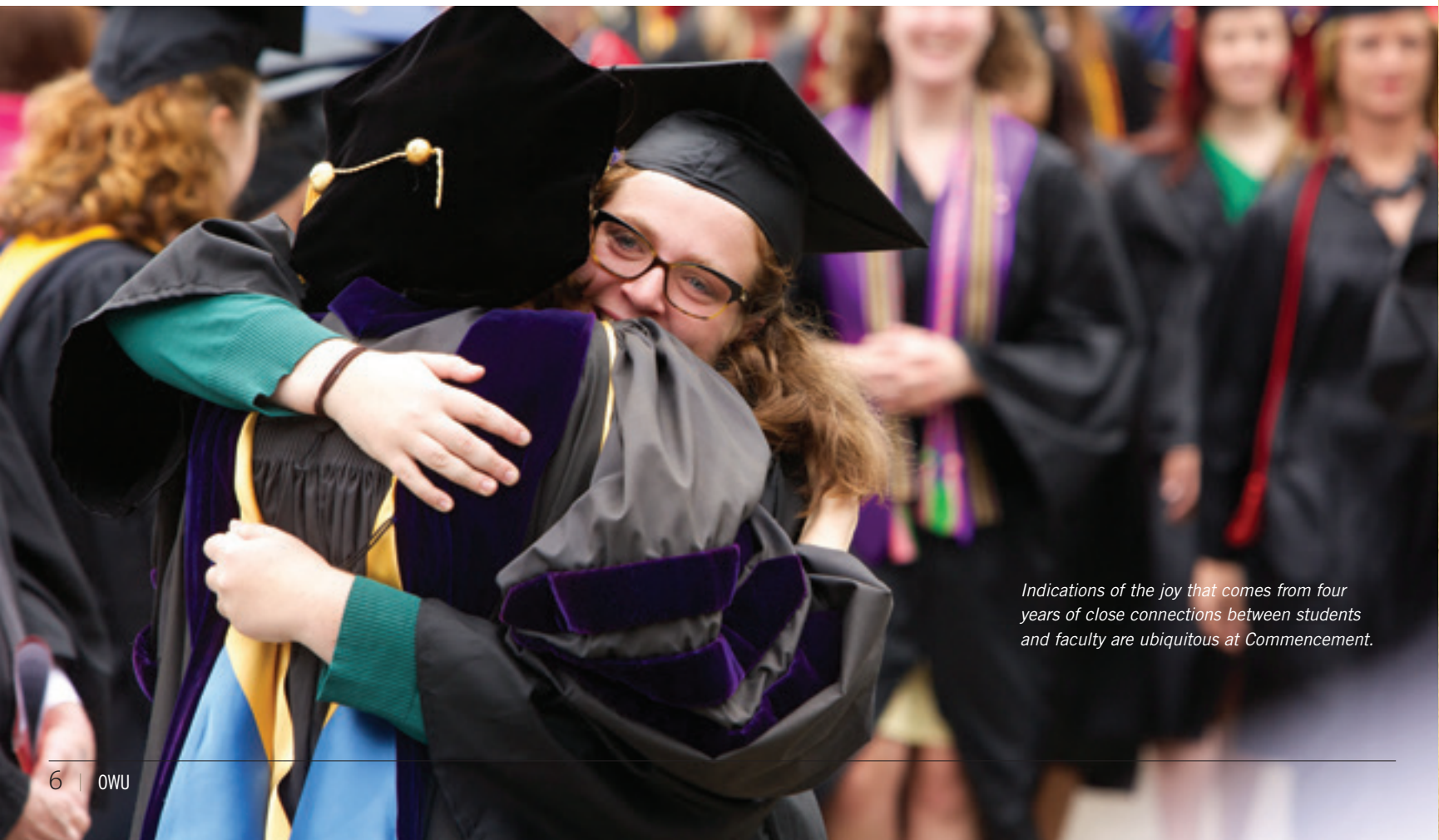
Indications of the joy that comes from four years of close connections between students and faculty are ubiquitous at Commencement.