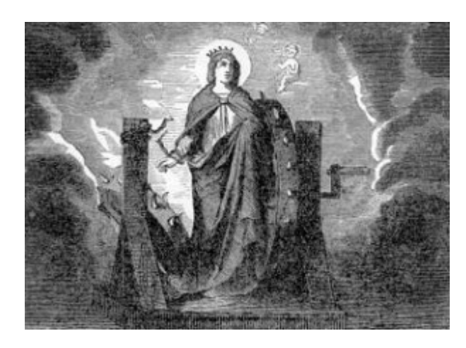
The Life of a Saint By: Rebecca Pollard

The men share the same miserable destiny, having lived a dehumanizing, dog-like life that forced them to go from one master to another and to beg on the streets to make a living. Although the costumes make reference to the 17<sup>th</sup> century, the characters statements and adverse circumstances remind spectators of contemporary issues still affecting our society. This production portrays many well-known themes echoed throughout Cervantes' work, such as marginalization, inequality and social justice. Four hundred years later, Cervantes work still asks to reflect on these issues; one of the reasons why his masterpieces continue to be studied, reinterpreted, valued, and celebrated. This conversation between Cervantes and his readers today proves, in more ways than one, that the author is alive and well.